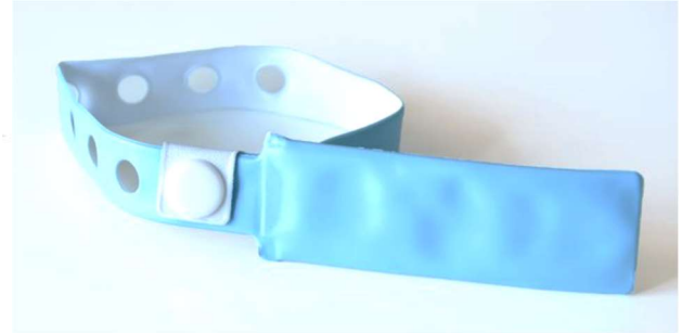
Your Logo Print here?